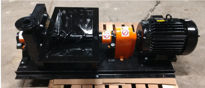
7.5HP Motor to Pump direct coupling