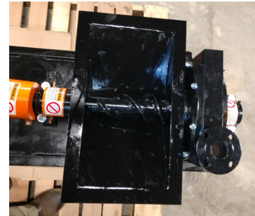
Product infeed screw provides positive flow